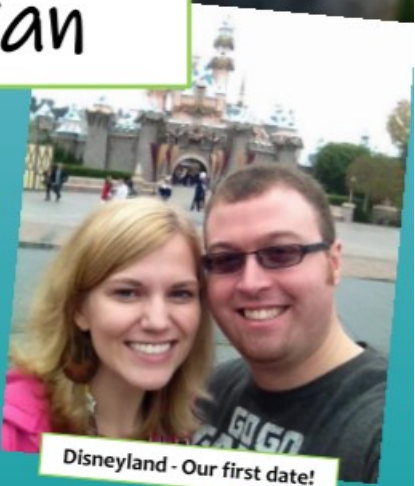
Disneyland - Our first date!

We Love: Geocaching, Board Games, Travelling, Reading, and Spontaneously Bursting into Song